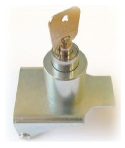
PalmLok for EU trailers